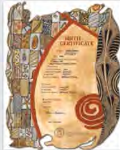
Victorian Aboriginal Heritage

A commemorative birth certificate celebrates a child's birth and helps preserve your family's history in a unique and lasting way. Certificates have been designed by local artists. They are printed on archival quality paper and fit a standard frame of 280mm x 355mm (11" x 14").