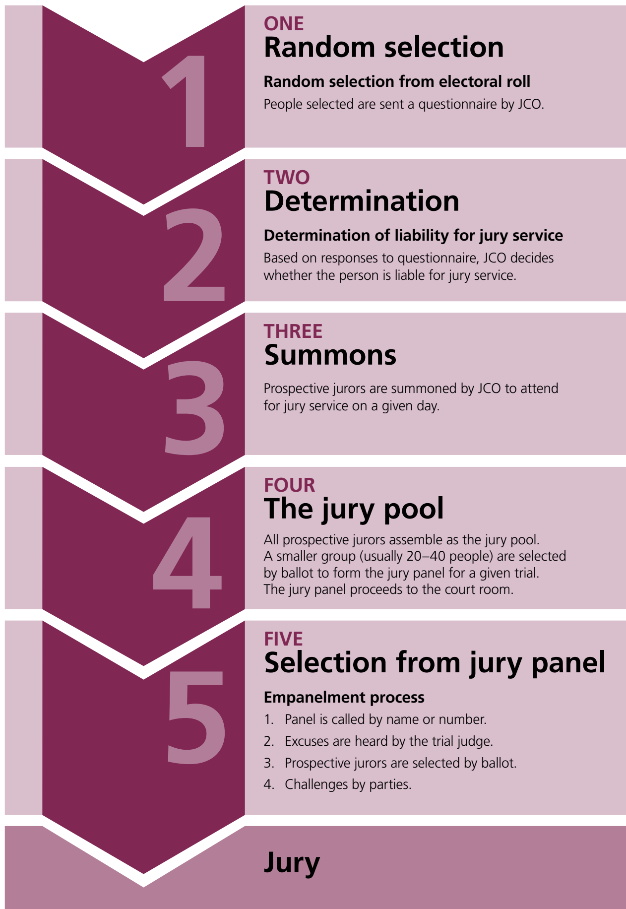
Figure 1: Jury selection and empanelment process